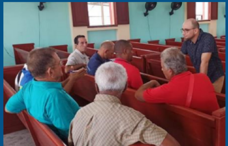
Small Groups in Action